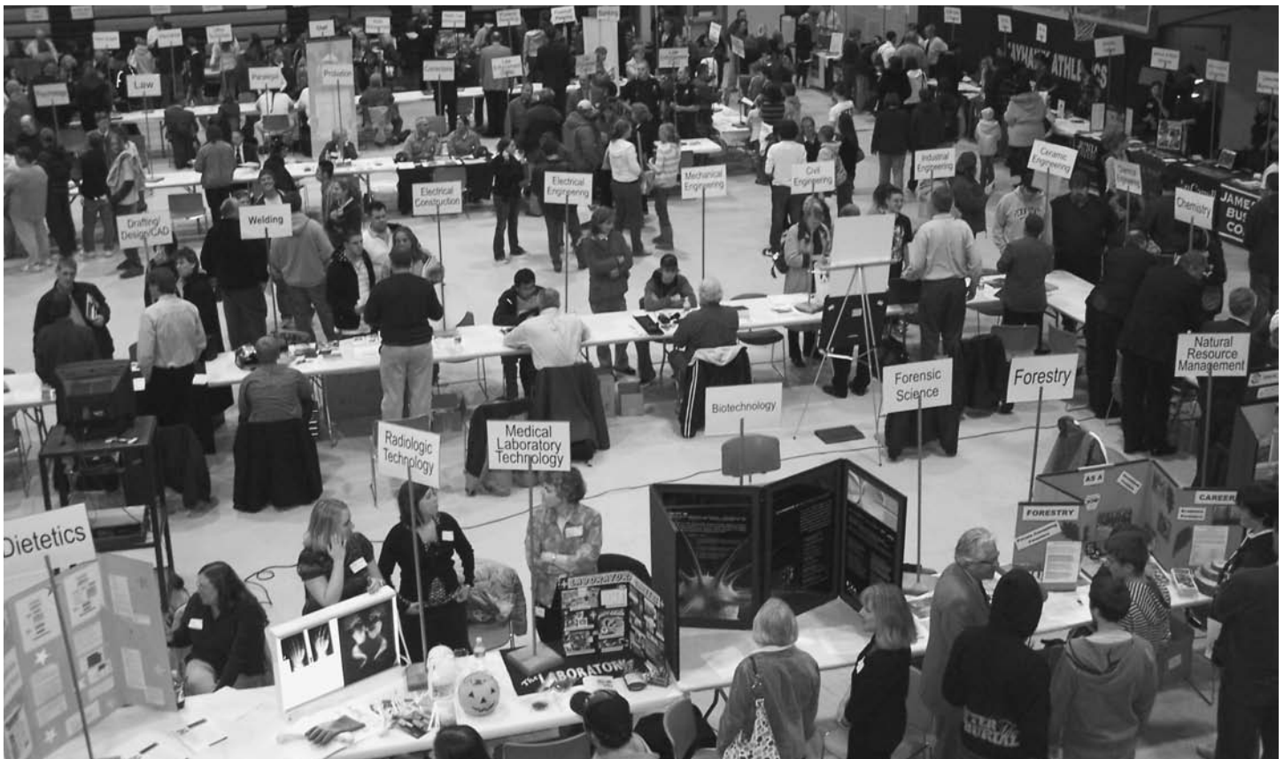
College and Career Night – Funding an Education – Jamestown Community College

Agnes Home Scholarship Fund Glenn Lee Akam, Jr. Memorial Scholarship Fund A. A. Amidon Scholarship Fund "All for Amy" Fund Harold R. Andersen Memorial Scholarship Fund Richard M. Anderson, Sr. & Richard M. Anderson, Jr. Memorial Scholarship Fund Wyman L. Ansley Scholarship Fund William C. Arrison Memorial Scholarship Fund Wendy Sue Axelson & Theodore Moll II Frewsburg School Scholarship Fund Mable L. Bailey Memorial Scholarship Fund C. Russell and Verona A. Barker Memorial Scholarship Fund Jack Bargar Scholarship Fund Ina Buell Barker and Constantine T. Barker Memorial Education Fund Charles E. Bartkowiak Memorial Scholarship Fund