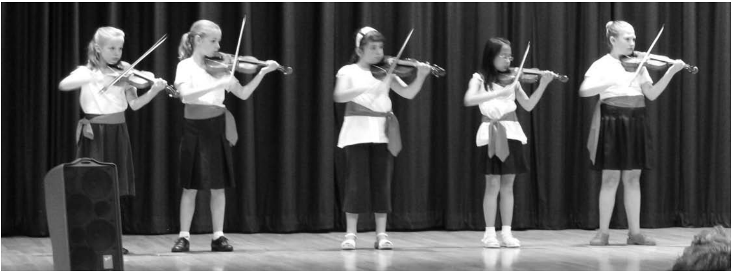
Jamestown Suzuki Strings Performance Edward and Marie Russo Memorial Suzuki Scholarship Fund Award Presentation