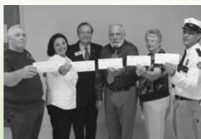
John Edward McLaughlin Fund, benefiting Randolph, N.Y., makes first awards

The Foundation's auditing firm is Moore & Myott, LLP. The basis for this information is the audited financial statements which can be inspected at the Foundation office or online at www.crefonline.org . A copy of the Foundation's last annual report, filed with the New York Secretary of State, may be obtained on request from the New York Department of State, 162 Washington Avenue, Albany, New York 12231.