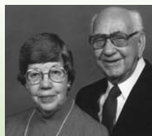
Allen R. and Margaret H. Findlay Fund Established